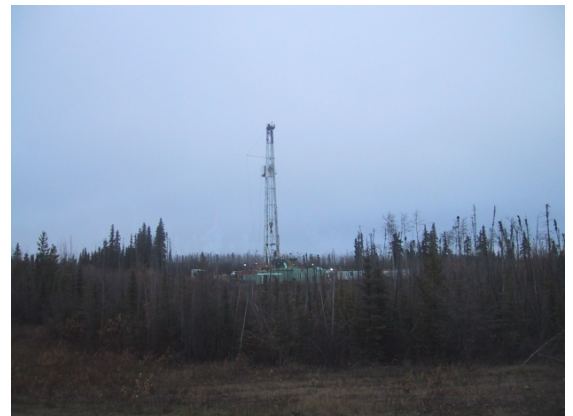
Precision Drilling was contracted to drill the first well of the Sawn Lake field.